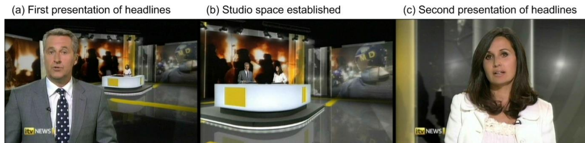
Figure 1. Shot types in the opening headline sequence of an ITV news bulletin.

ITV news bulletins begin with a sequence of headlines and program titles divided into four sections. First, the headline for the main news item presented by one reporter in close-up before a small section of news footage to illustrate the item, for a total of between 2 and 6 shots (see Figure 1a). This is followed by the opening title shot featuring a track and pan across a series of glass panels displaying images from current news items, which lasts for about 18.5 seconds in the 1330 bulletins and for 20 to 21 seconds in the two evening broadcasts (Figure 1b). The headlines are then developed in a sequence of between 4 and 10 shots. Unlike the opening segment of the headlines, this is presented by a newsreader seated behind a desk and is shot as a medium close-up. The final shot of the opening sequence again features the ITV news logo, but this time lasts for only about 2.5 seconds. A single journalist presents the lunchtime bulletin and covers both of the headline segments in the opening sequence, but the 1830 and 2200 broadcasts both have two presenters (a woman and a man), and the opening sequence switches between them. In the example displayed in Table 1, the first of the headline sections is presented by one newsreader (Nina Husain), and the beginning of the next headline sections is presented by the other (Mark Austin), and then the headlines announced over actuality footage for subsequent news items switches back and forth between the presenters (Figure 1c).