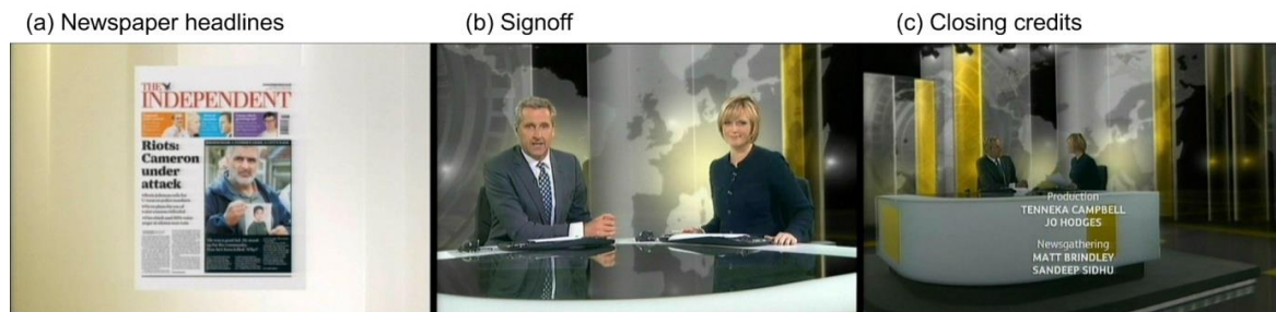
Figure 3. Shot types in the closing sequence of an ITV news bulletin.

Each bulletin ends with the same sequence of structural elements: the sign-off by the presenter(s), a credits sequence, and a title card for ITN. This sequence may comprise three shots, in which each element is separate, or two shots, in which the sign-off and the credits are continuous (see Figures 3b and 3c). The credits shot at the end of the news bulletin features a mobile camera that performs the opposite movement to that in the opening title sequence, pulling away from the news desk to indicate the end of the broadcast (compare Figure 3c with Figure 1b). On occasion, the credits will be shown over news footage: In the 2200 bulletin from August 8, the credits were shown over a 20.4-second shot showing live footage of the London riots. The amount of screen time taken by the closing sequence ranges from 14.3 s to 47.1 s, with a median of 25.6 s.