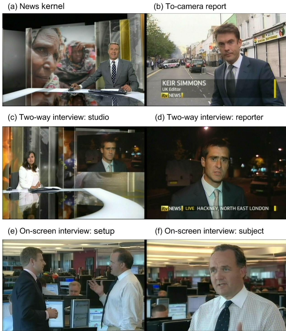
Figure 2. Shot types in news items sequence of an ITV news bulletin.

The last news item on the ITV television news is typically a human interest story, and it is always introduced with the words, "And finally. . . ." Of the bulletins included in this sample, only the 1330 bulletins from August 9 and 10 did not feature a final news item of this nature. The place in the discourse structure of this element is typically between the recap of the main news item or the review of the newspaper headlines in the 2200 bulletins and the closing sequence; and the median running time of the final item is 110.5 s, with a range of 76.6 s to 140.4 s. This segment will often be of a (relatively) lighter